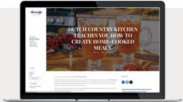
SPONSORED CONTENT PARTNERSHIPS Dutch Country General Store