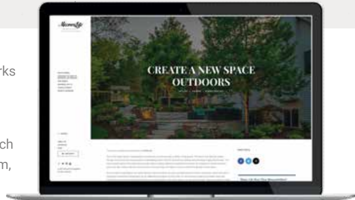
SPONSORED CONTENT PARTNERSHIPS Rost Landscaping/Superior Gardens

MISSOURILIFE.COM 32,363 Unique Monthly Visitors on average